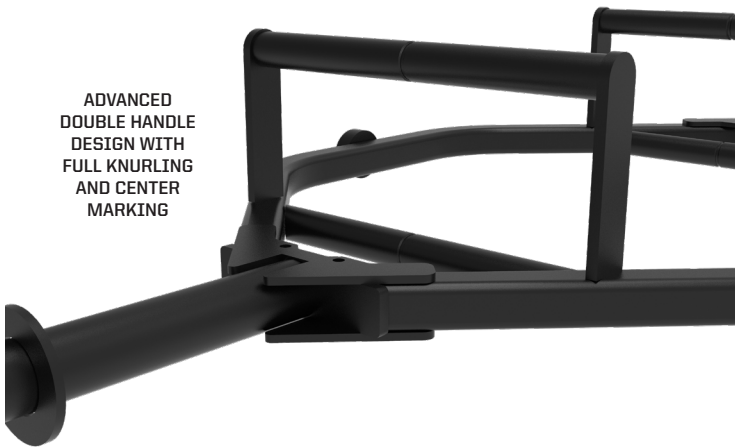
ADVANCED DOUBLE HANDLE DESIGN WITH FULL KNURLING AND CENTER MARKING