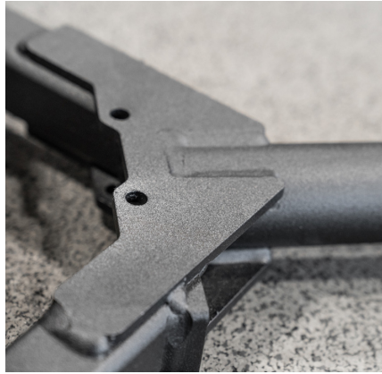
REINFORCED FOR EXTREME LOADING