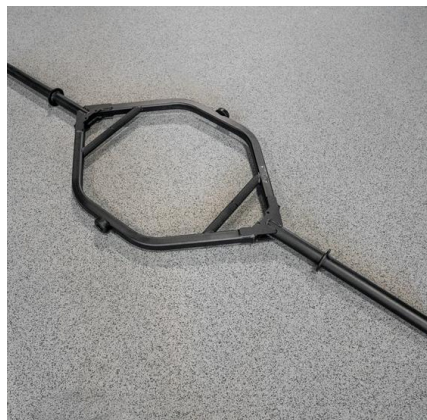
SINGLE HANDLE DESIGN