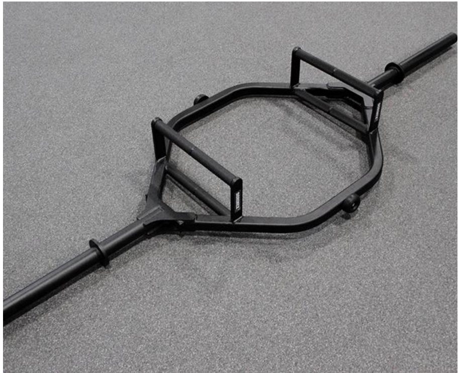
DOUBLE HANDLE DESIGN