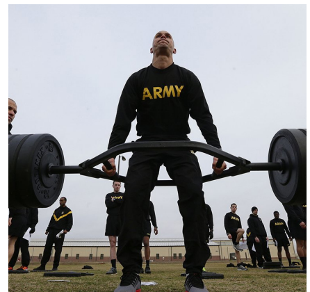
PREFERRED TRAP BAR OF THE ARMY ACFT