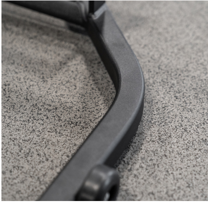
SINGLE PIECE SIDE BARS ELIMINATE STRESS POINTS