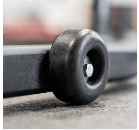
RUBBER BUMPERS TO PROTECT FLOORS