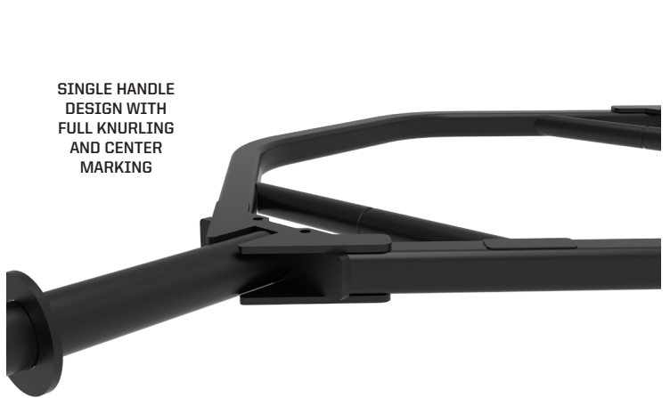
SINGLE HANDLE DESIGN WITH FULL KNURLING AND CENTER MARKING