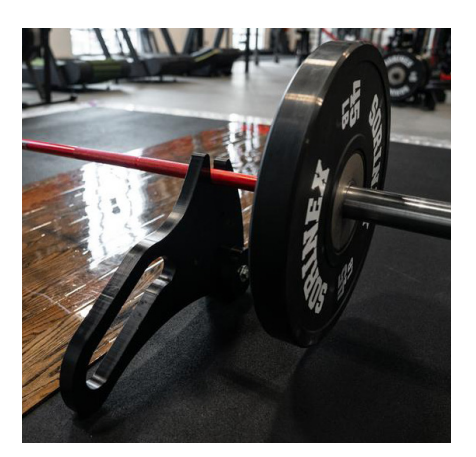
LOAD AND UNLOAD BAR WITH EASE