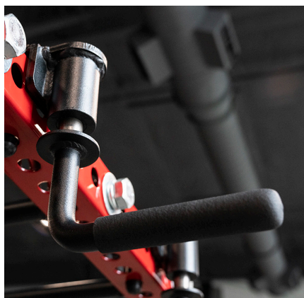
ROTATE IN 45-DEGREE INCREMENTS