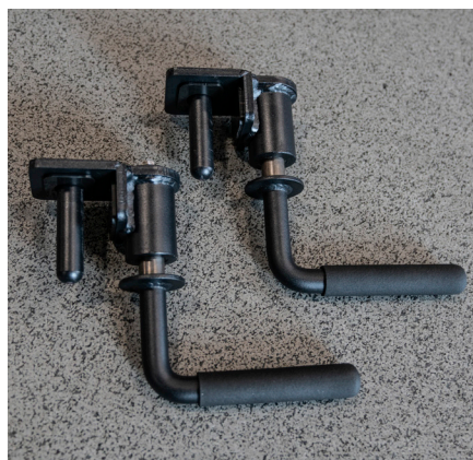
INDEXING HANDLE DESIGN