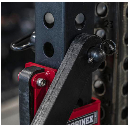
EASY TO STORE WITH INCLUDED HITCH PINS