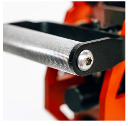
LOCKING COMPRESSION LEVER