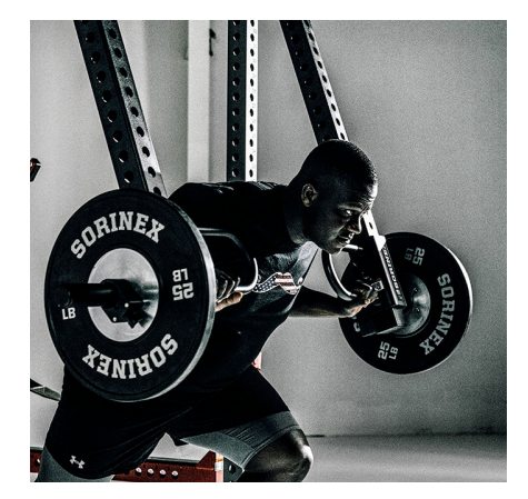
UPPER & LOWER BODY MOVEMENT CAPABILITIES