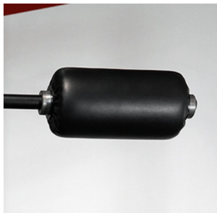
10" PAD LENGTH