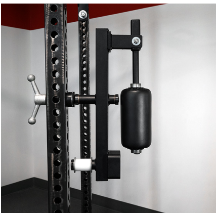
COLLAPSABLE SPACE-SAVING DESIGN