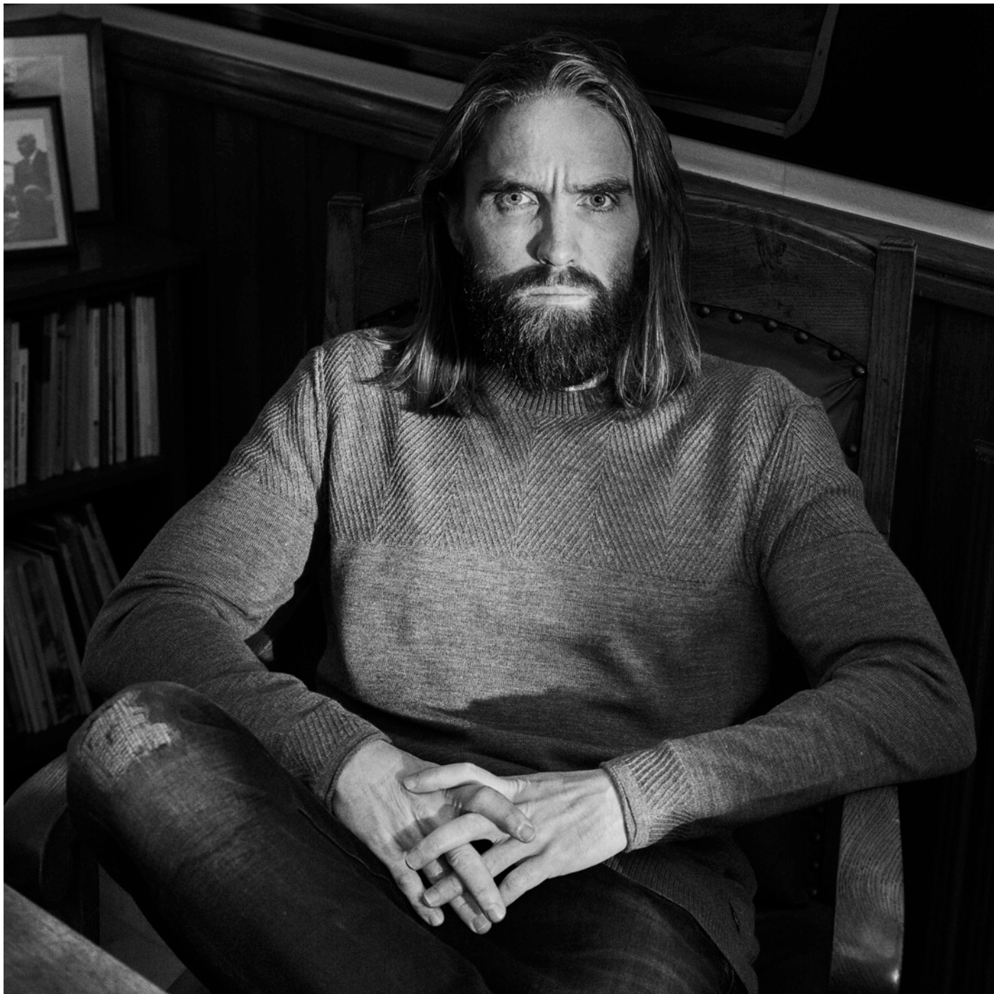
Montecello Knit / Repi N41 Distressed Jeans