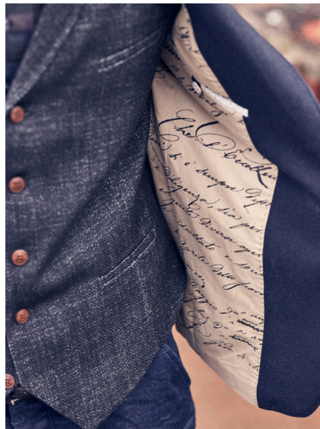
Diamond Crown Trilby in navy Paulo Pocket N14 Pants w1153 Bacco Nottingham Shirt San Giorgio Napoles Waistcoat Sergente Shoes