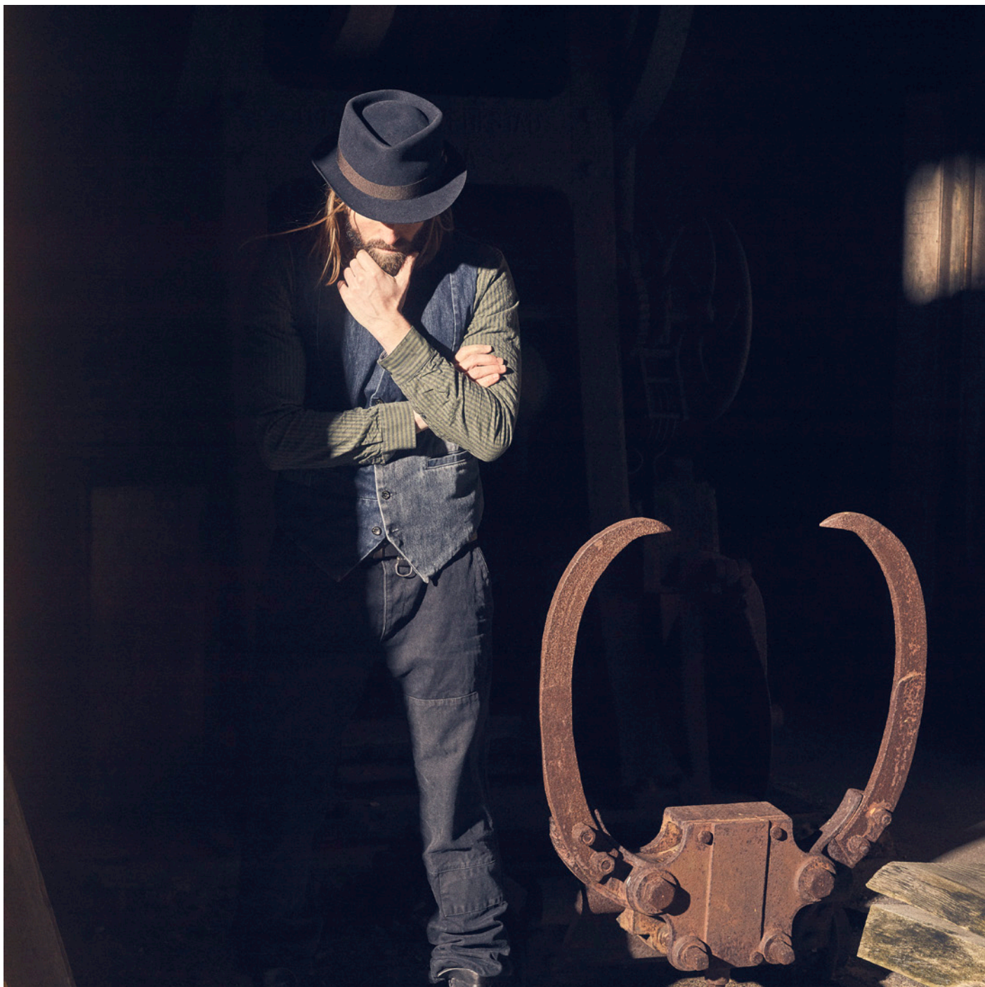
Sergeants Roven Trousers / Taibon Meda Shirt / Aero Denim Gilet / Diamond Crown Trilby in navy