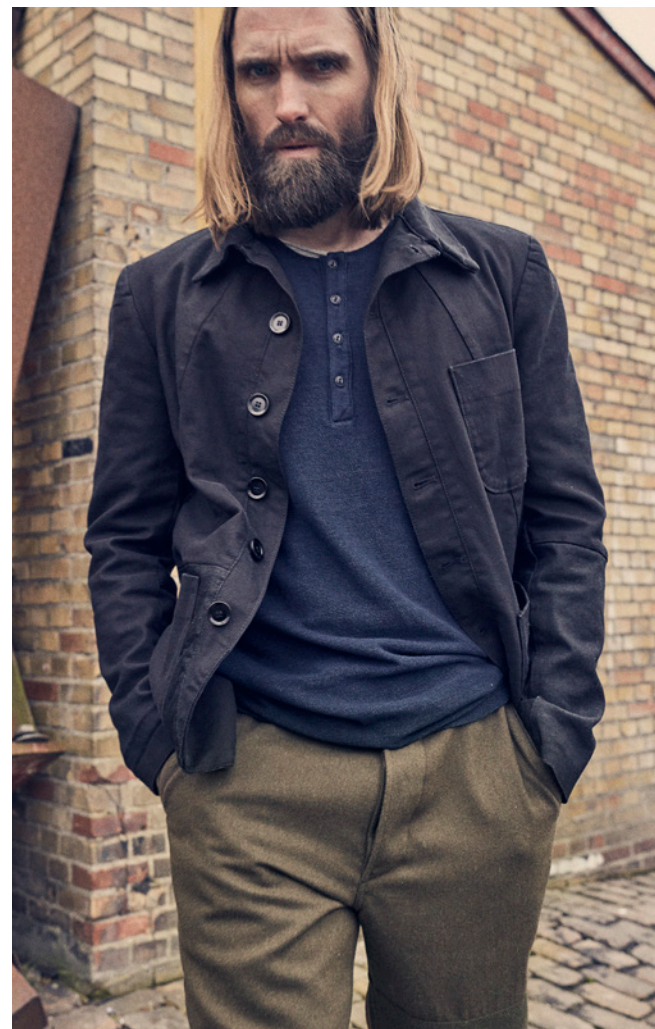
Aero Denim Jacket Varis Granddad Sergeants Trousers Tenente Colonnello Boots