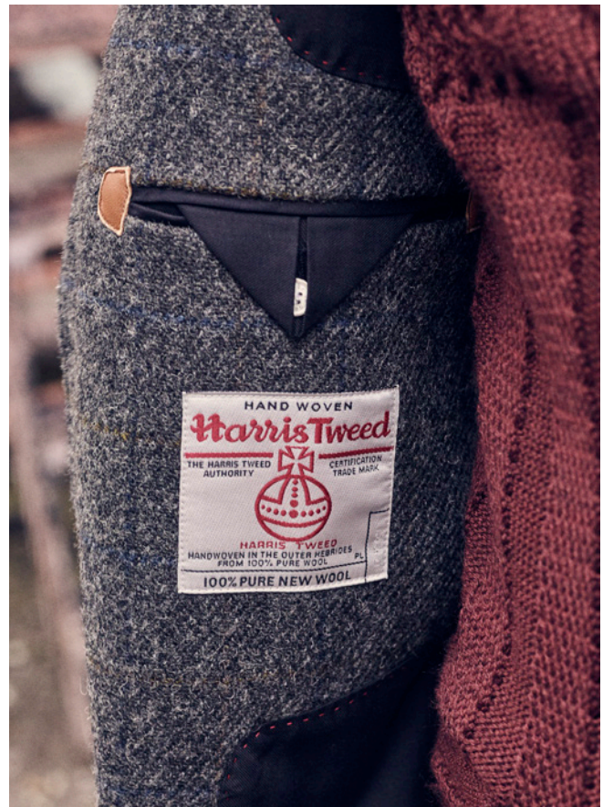
Oria Harris Tweed Blazer Lumi Merino Cardigan Bacco Supercar Shirt Repi N42 Jeans Maletti Shoes