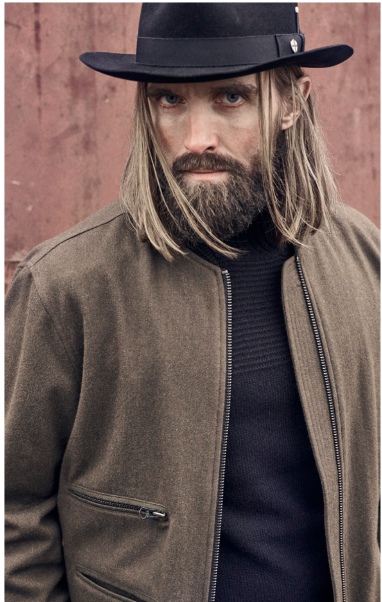
Teardrop Fedora in black / Army Tankers Jacket / Grosseto Roll Neck Knit in black / Vinci N39 Jeans