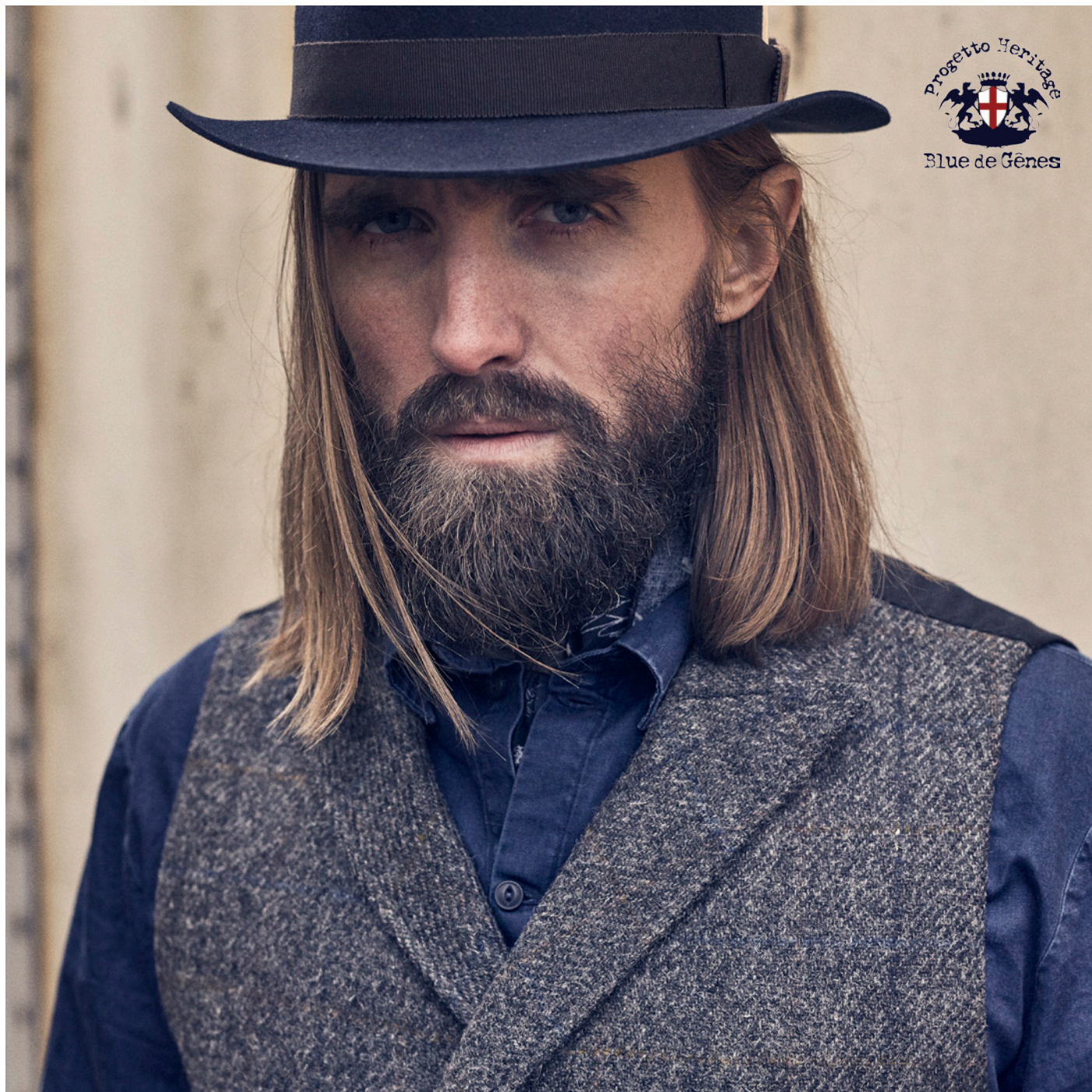
Diamond Crown Trilby in navy / Casella Harris Tweed Waistcoat / Costa Denim Shirt