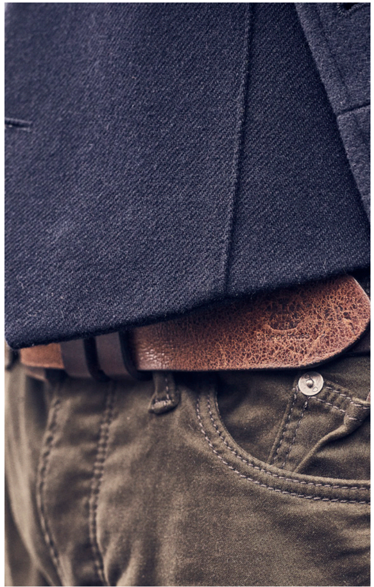
Diamond Crown Trilby in brown / Campi Craft Shirt in vintage yellow / Campasso Tenco Coat in navy / Pieve Mark Gilet in navy / Repi Oister Jeans / Piceno Leather Belt / Maletti Shoes