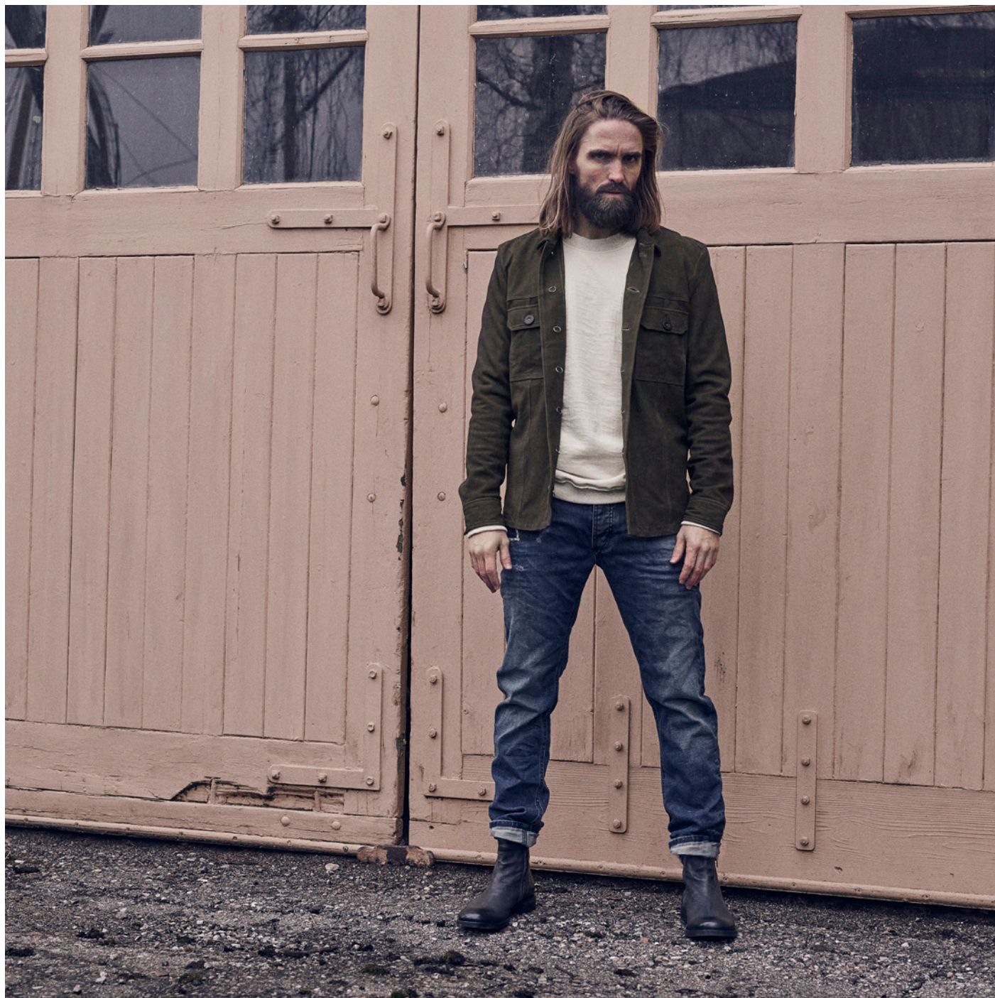
Vinci Shibuya Jeans / Kumamoto Japan Sweatshirt / Como Leather Jacket / Giovanni Ufficiali Boots