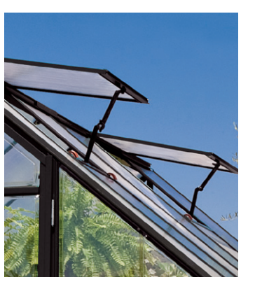
2 vent windows included