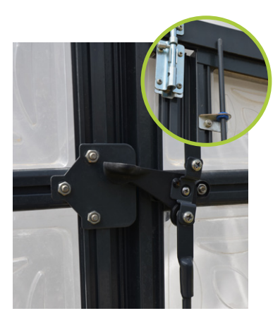
Locking system tightly fastens onto the structure frame