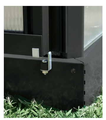
Galvanized steel base & magnetic door catch included