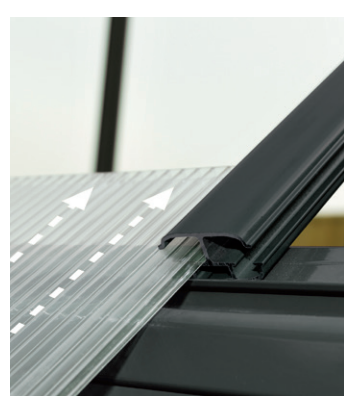
Sliding panels' assembly system