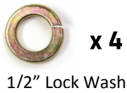
1/2" Lock Washer