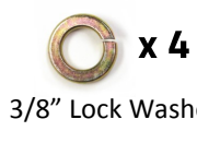
3/8" Lock Washer