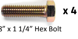
3/8" x 1 1/4" Hex Bolt