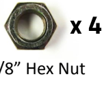
3/8" Hex Nut