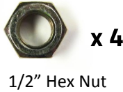
1/2" Hex Nut