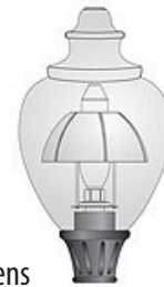
DSR-MOG with -27A Globe