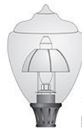
DSR-MOG with -29A Globe