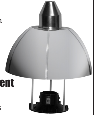
DSR-MOG-For mogul socket DSR-MED-For medium socket

The Dark Sky Reflector is affordable and can be used on new or existing lighting fixtures to improve your impact on the environment. The reflector meets both old and new IES criteria for Uplight minimization. The amount of cut-off you require can be achieved through the proper positioning of the component. With the three standard mounting heights, you can achieve maximum usable light while still allowing only a minimal amount of Uplight.