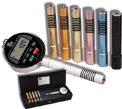
DD-3 Digital MS-1