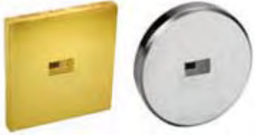
Table of Content - Rockwell Hardness Testing