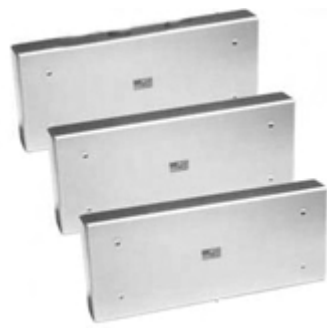
Table of Content - Brinell Hardness Testing