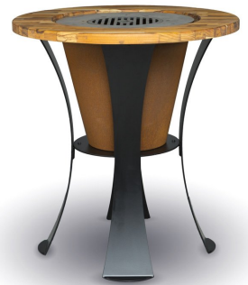
Leaf Grill Table