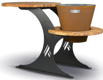
Duo Grill Table