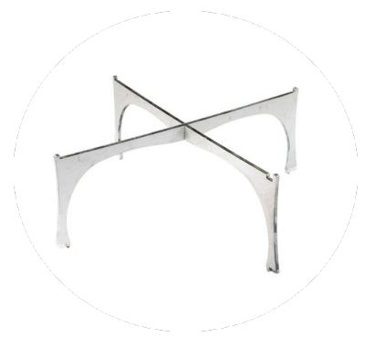
Grill Grate Risers