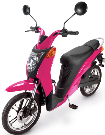
Gen 1 with mirrors