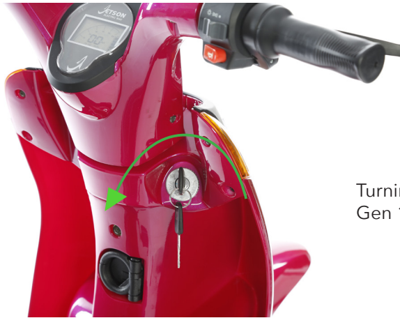
Turning the Gen 1 Off

To turn your Gen 1 off, make sure it is not in motion, then turn the key counter clockwise. Once the key is removed from the Ignition, unlock the Seat Cask and turn the battery switch to Off.