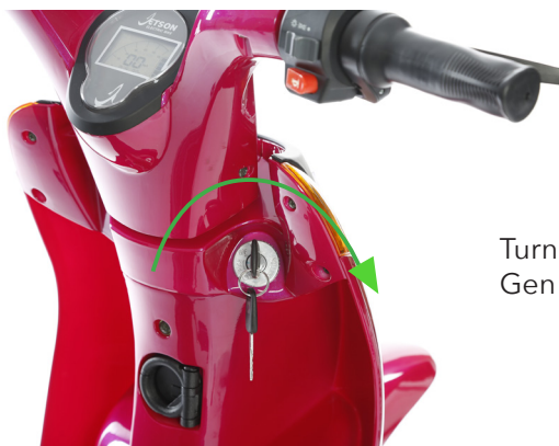
Turning the Gen 1 On