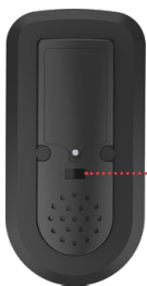
Deck Light Switch (Under the Deck)