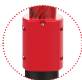
Stem Battery Box