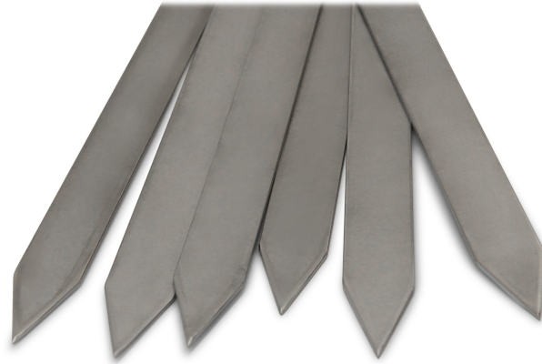
*Skewers shown are 3/4" wide