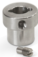
*Commercial (NSF certified) skewer adapter shown

The KabobMaster Stone Series skewers can be paired with a KabobMaster Rotisserie to automate the skewer turning process while cooking. The skewer adapters are compatible with our 1/2 in. [12.7 mm] wide skewers and are available in residential and commercial (NSF certified) variants. The commercial variants feature a custom set screw with a slotted drive and a portion of the threads removed to comply with the NSF/ANSI Standard 4.