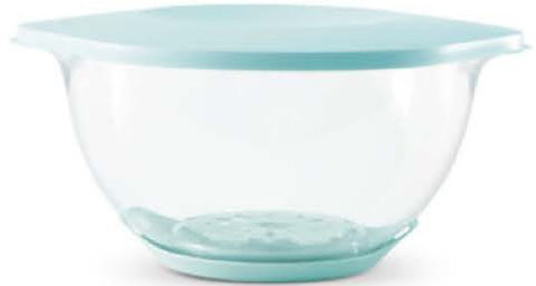
Storage Lid (attached to Bowl)