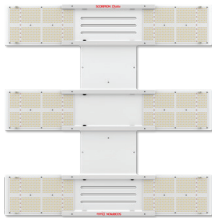
HLG SCORPION DIABLO Spec Lamp