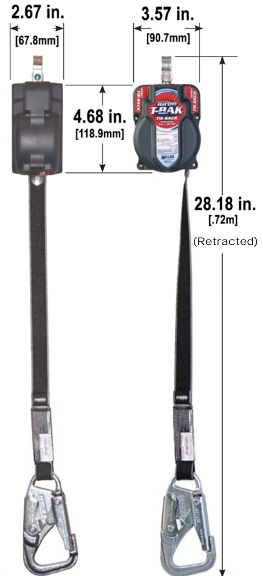
MFLT-1/7.5FT Miller Turbo T-BAK Tie-Back Personal Fall Limiter

*ANSI Z359-2007 compliant for connectors which meet the 3,600lb gate requirements.