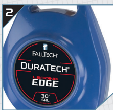
2 Rugged lightweight aluminum housing