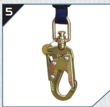
5 Load-indicating swivel snap hook