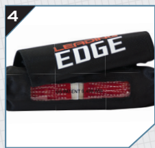
4 External energy absorber with patented ViewPack® cover