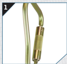
1 Extra large, double locking anchorage carabiner included