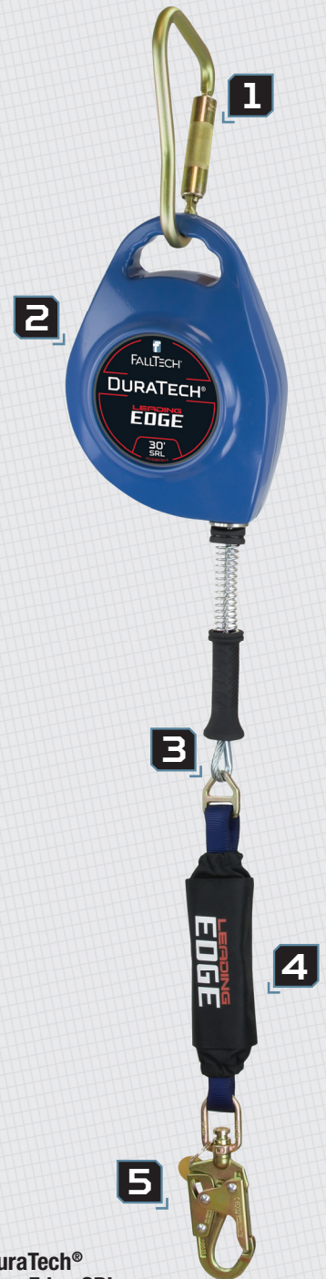
7232CLE | 30' DuraTech® Leading Edge SRL