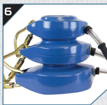
6 Stackable housing