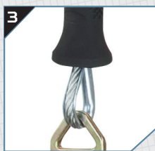
3 7/32" galvanized steel cable