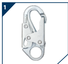
Steel Snap Hook