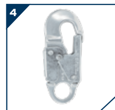
Aluminum Snap Hook