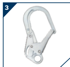
Steel Rebar Hook