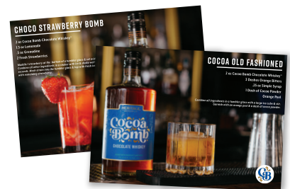
COCKTAIL TEAR PADS