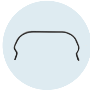
Mattress retainer bar (1) *