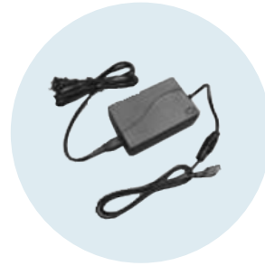
Input power cord and power supply (1)