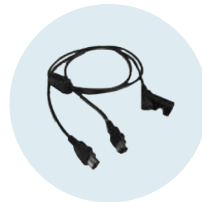
Pairing cable (1) *