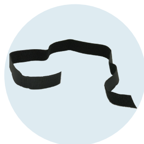
Bed leg strap (1) *

* Included in Twin XL bases. Used when connecting two bases together.