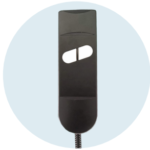
Wired Remote control (1)

Before discarding any packing materials, check the adjustable bed carton and verify all items in the parts list are included.