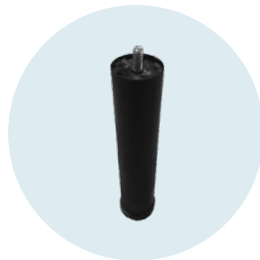
Post bed legs (6)