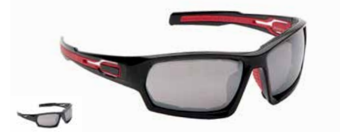
WITH ADDED FOAM PROTECTION