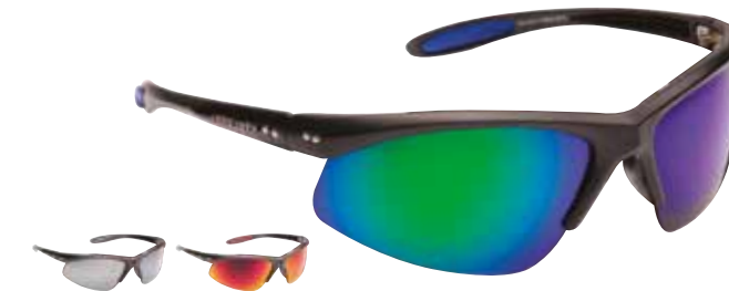
POLARIZED LENS WITH MULTI COATING