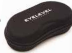
ZIP CASE LARGE