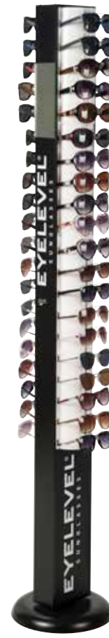
EYELEVEL FLOOR 40