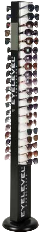
EYELEVEL FLOOR 40