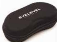
ZIP CASE LARGE