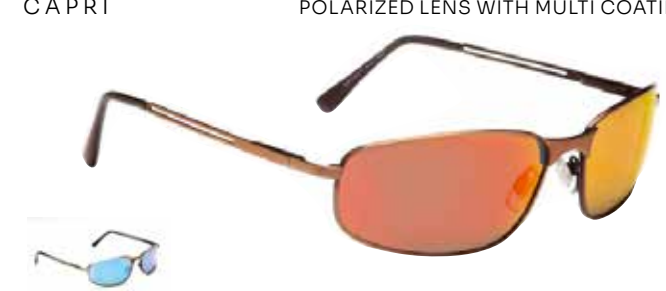
POLARIZED LENS WITH MULTI COATING