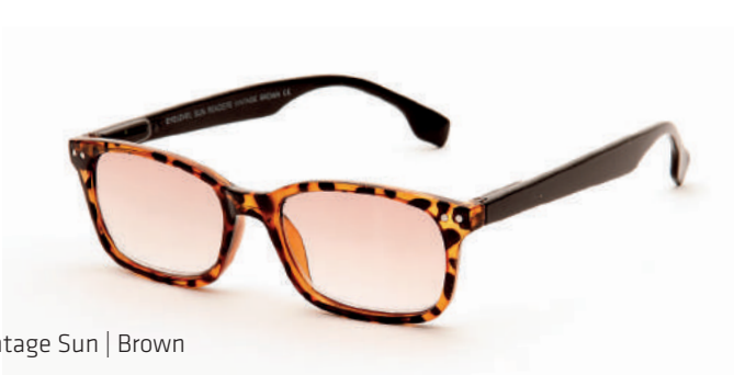
Vintage Sun | Brown