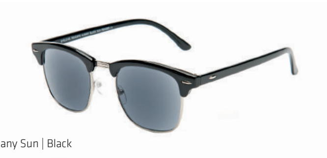
Albany Sun | Black