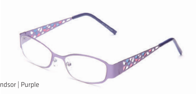
Windsor | Purple