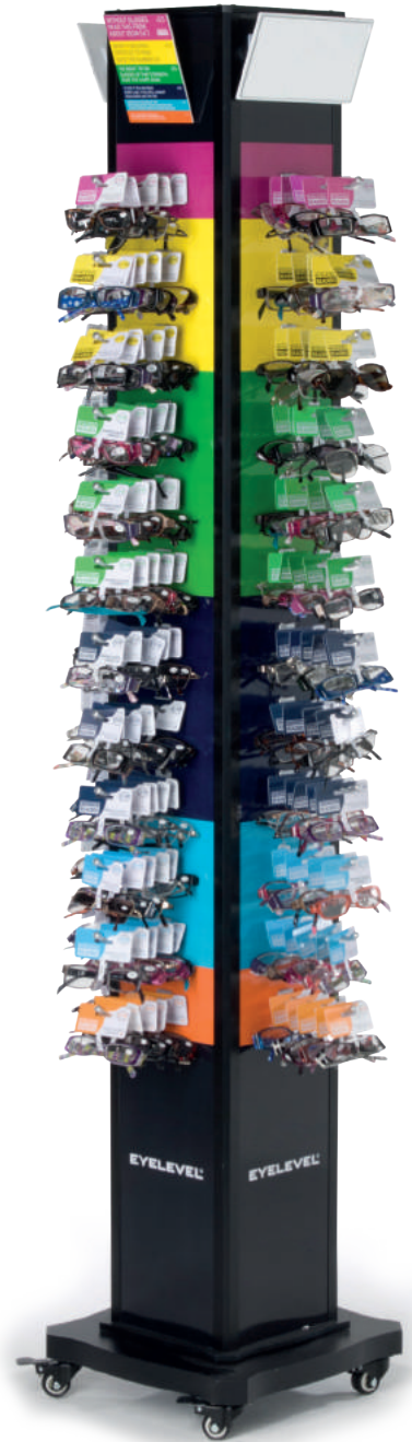
Square Floor Stand