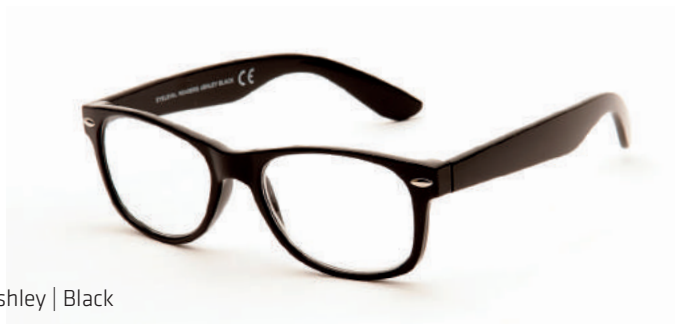
Ashley | Black