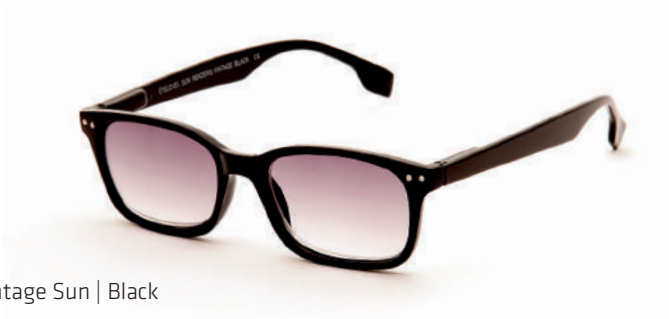
Vintage Sun | Black