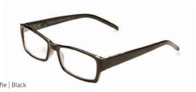
Alfie | Black