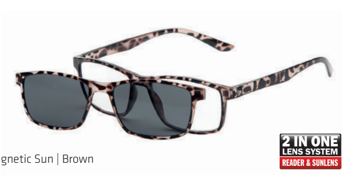
Magnetic Sun | Brown