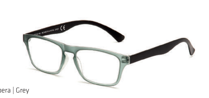
Opera | Grey