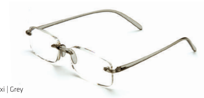
Flexi | Grey