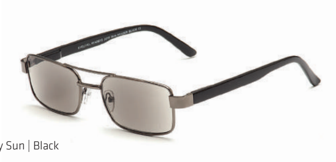
Jury Sun | Black

Let the sunshine in. Choose from this stunning range of readers designed for the outdoors.