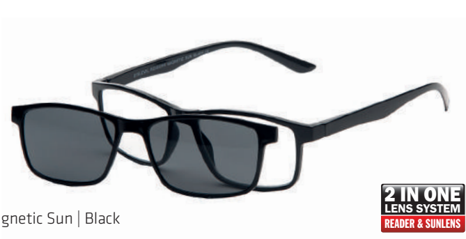
Magnetic Sun | Black