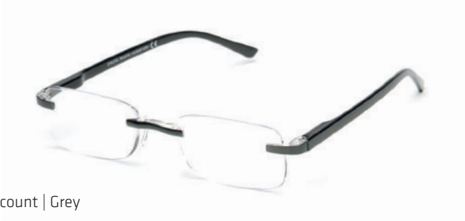
Viscount | Grey