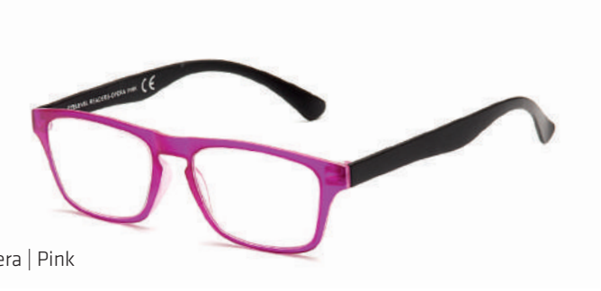
Opera | Pink