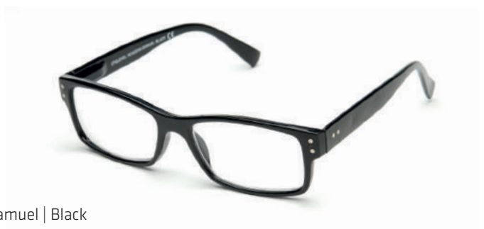
Samuel | Black