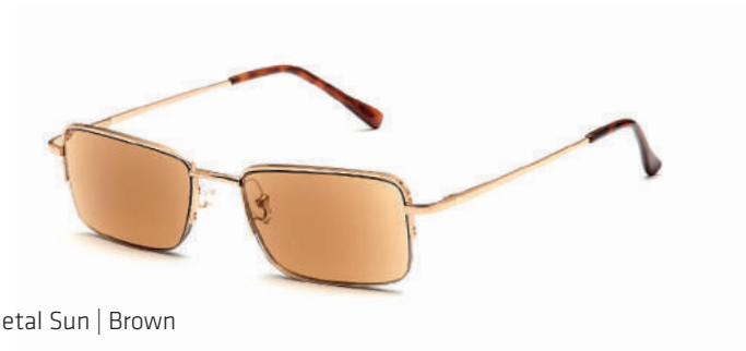
Metal Sun | Brown