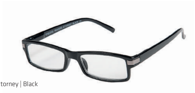
Attorney | Black