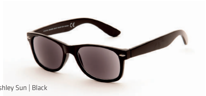
Ashley Sun | Black