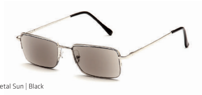
Metal Sun | Black