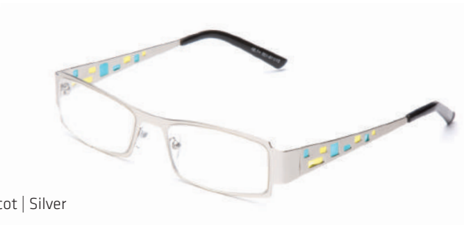
Ascot | Silver