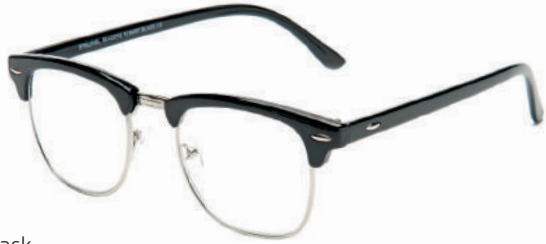
Albany | Black