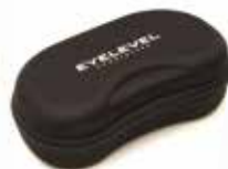
ZIP CASE MEDIUM