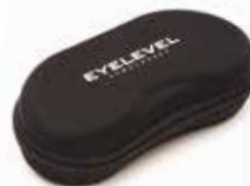
ZIP CASE LARGE