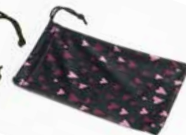
HEART PRINTED POUCH