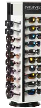
EYELEVEL COUNTER 40