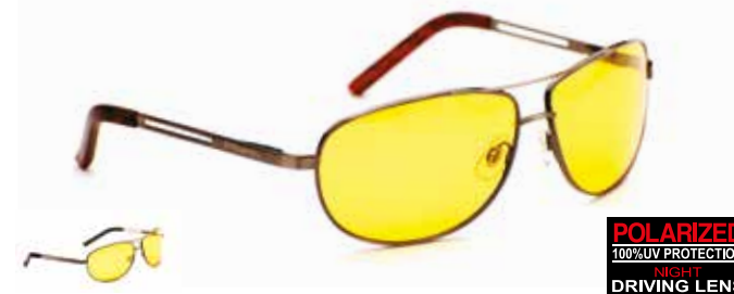
POLARIZED NIGHT DRIVER

POLARIZED 100%UV PROTECTION NIGHT DRIVING LENS