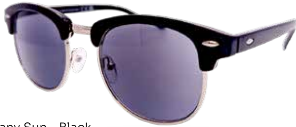
Albany Sun - Black