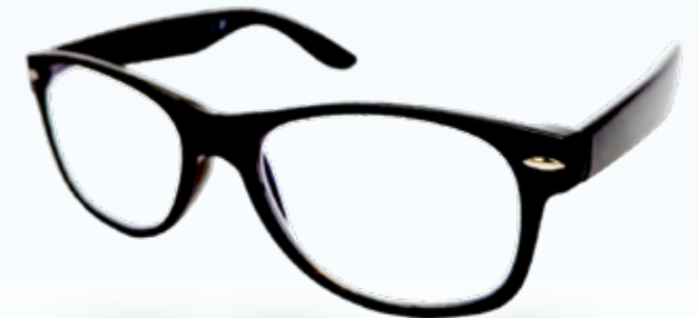
Blue Block 2