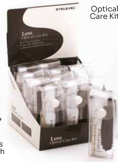
Optical Care Kit