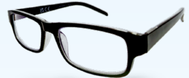
Alfie Anti Blue

Improve your sleep and protect your eyes with the enhanced blue light filter built into these lenses. Designed to protect your eyes from computer screens, tablets and phones.