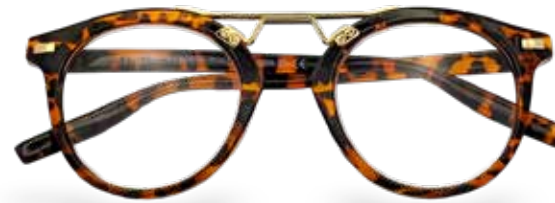
Boston - Brown