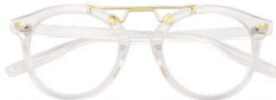
Boston - Clear