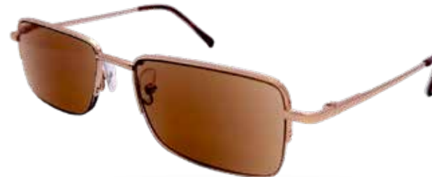
Metal Sun - Brown