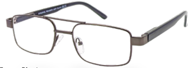
Jury - Black