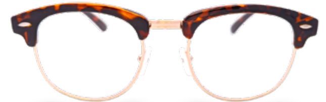
Albany - Brown