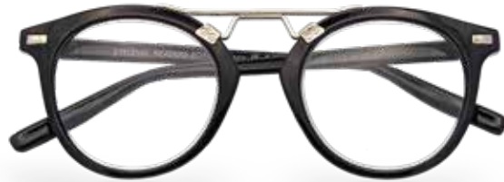
Boston - Black