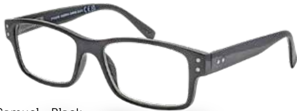
Samuel - Black