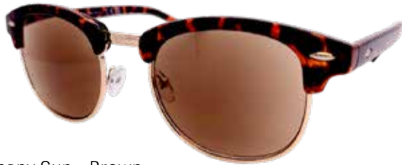
Albany Sun - Brown