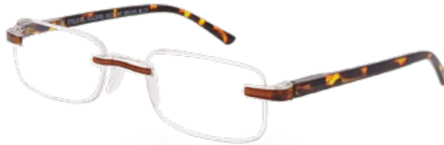
Viscount - Brown