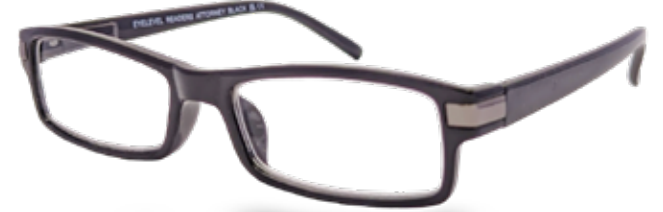
Attorney - Black