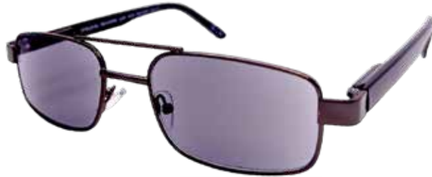
Jury Sun - Black