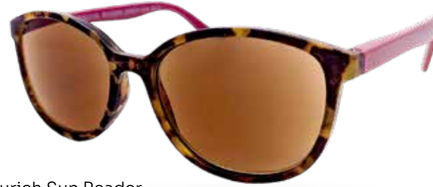
Zurich Sun Reader