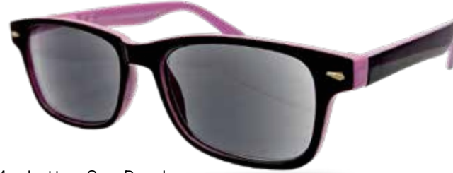
Manhattan Sun Reader