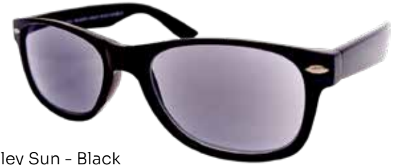
Ashley Sun - Black