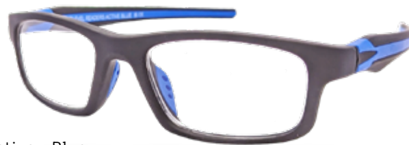
Active - Blue