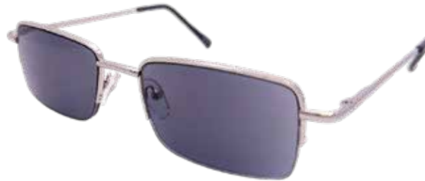
Metal Sun - Black