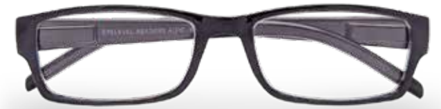
Alfie - Black