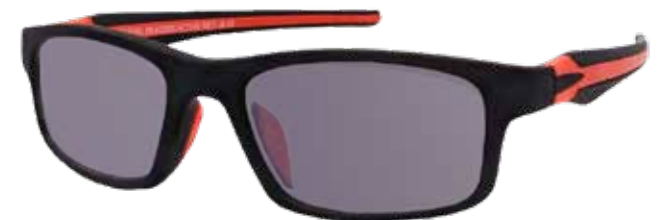
Active Sun - Red