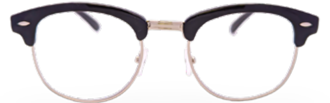
Albany - Black