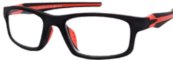
Active - Red