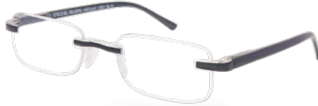
Viscount - Grey