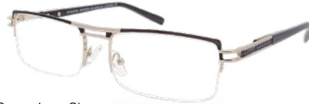
Sovereign - Chrome