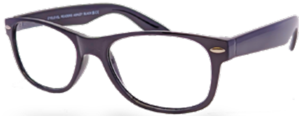
Ashley - Black