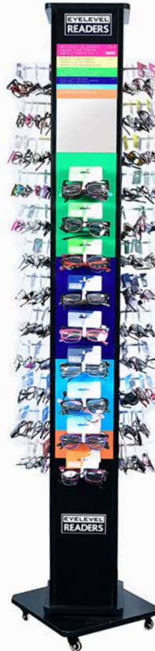
Square Floor Stand