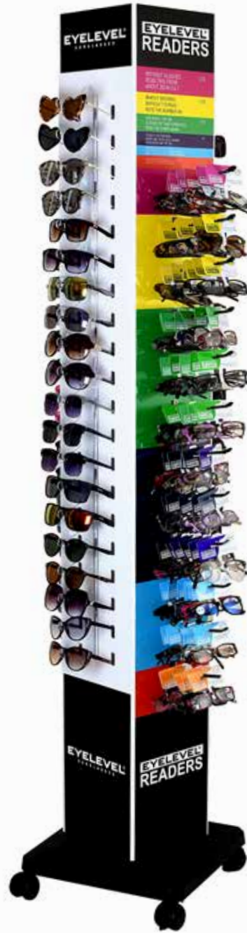
Combi Floor Stand