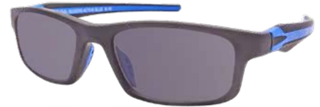
Active Sun - Blue