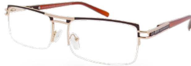
Sovereign - Gold