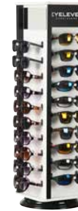
EYELEVEL COUNTER 40