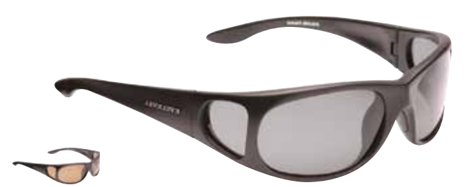
GLARE BLOCKING SIDE SHIELDS