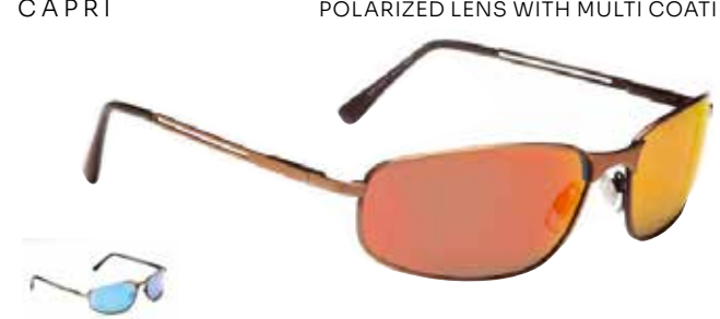
POLARIZED LENS WITH MULTI COATING