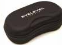
ZIP CASE MEDIUM