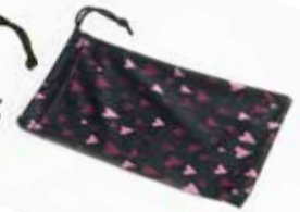
HEART PRINTED POUCH