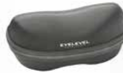
ZIP CASE LARGE