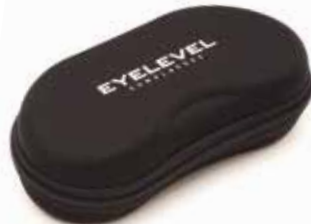
ZIP CASE LARGE