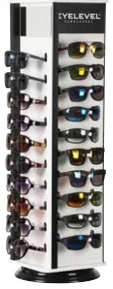
EYELEVEL COUNTER 40