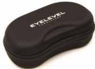
ZIP CASE MEDIUM