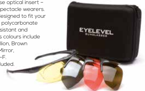
Shooting Glasses Set with Optical Insert

Shoot with accuracy and confidence. These unique 4-in-1 shooting glasses include an easy-to-use optical insert – detachable for non-spectacle wearers. The optical insert is designed to fit your prescription size. Our polycarbonate lenses are impact-resistant and interchangeable. Lens colours include Sodium Yellow, Vermillion, Brown and Grey with Silver Mirror, conforming to EN166-F. Protective case is included.