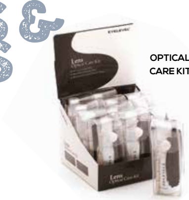
OPTICAL CARE KIT

Display your sunglasses in style while keeping them in spotless condition.