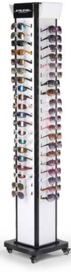
SQUARE EYELEVEL 80