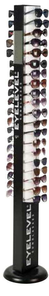
EYELEVEL FLOOR 40