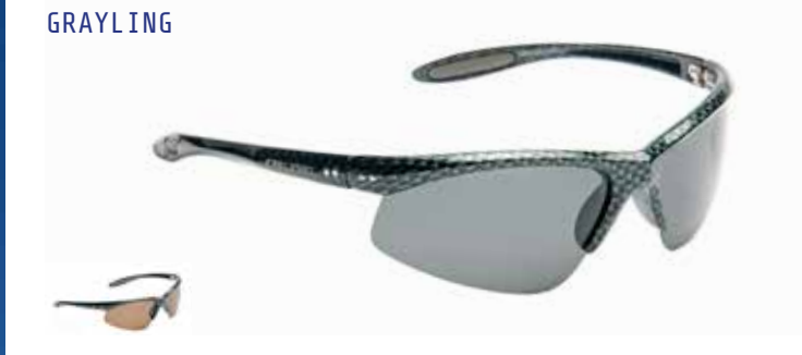
MARITIME Polarized lens with multi coating