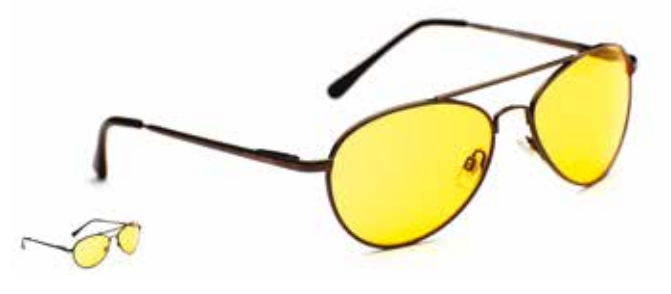
NIGHT DRIVER 2