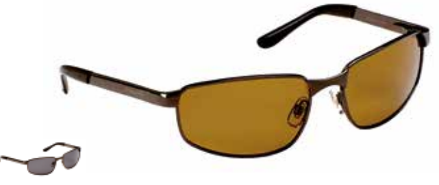
HARRISON with Bamboo Temples