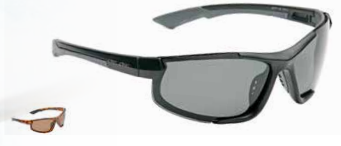
PREDATOR Polarized lens with multi coating