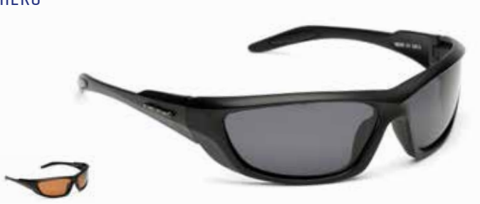
QUAYSIDE Polarized lens with multi coating