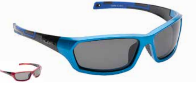
SUNSEEKER Polarized lens with multi coating