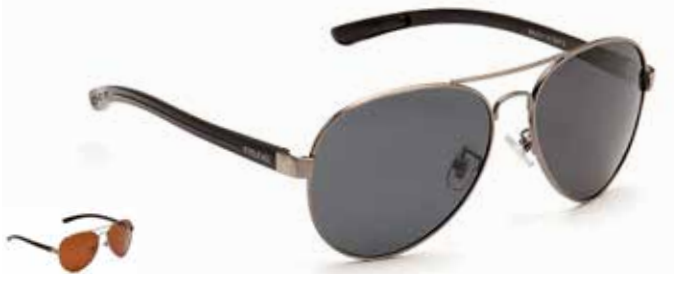
MARCO with Aluminium Temples