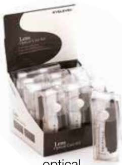
optical care kit

Keep your sunglasses in great condition and display in style.