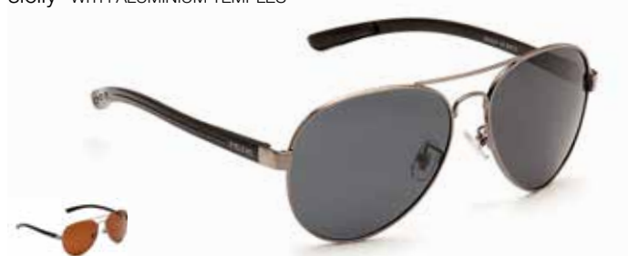
sicily WITH ALUMINIUM TEMPLES