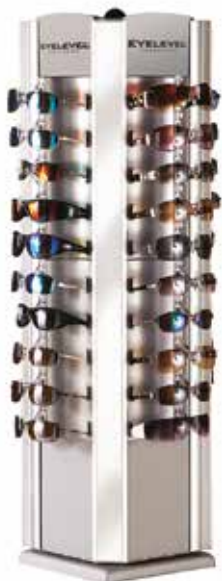
eyelevel counter 40