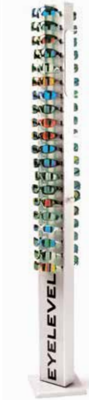
eyelevel floor 40