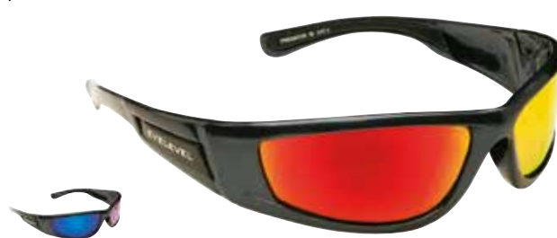
predator POLARIZED LENS WITH MULTI COATING