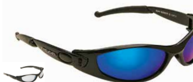
sunseeker POLARIZED LENS WITH MULTI COATING