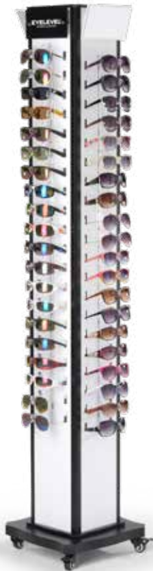
square eyelevel 80