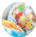
Global summary; regional coverage

IHS Markit's Chemical Economics Handbook – Surfactants, Household Detergents & Their Raw Materials is the comprehensive and trusted guide for anyone seeking information on this industry. This latest report details global and regional information, including