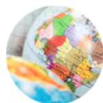
Global summary; regional coverage

IHS Markit's Chemical Economics Handbook – Styrene-Acrylonitrile (SAN) Resins is the comprehensive and trusted guide for anyone seeking information on this industry. This latest report details global and regional information, including