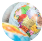
Global summary; regional coverage

IHS Markit's Chemical Economics Handbook – Sodium Sulfate is the comprehensive and trusted guide for anyone seeking information on this industry. This latest report details global and regional information, including