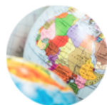
Global summary; regional coverage

IHS Markit's Chemical Economics Handbook – Resorcinol is the comprehensive and trusted guide for anyone seeking information on this industry. This latest report details global and regional information, including