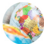
Global summary; regional coverage

IHS Markit's Chemical Economics Handbook – Polyurethane Foams is the comprehensive and trusted guide for anyone seeking information on this industry. This latest report details global and regional information, including