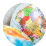
Global summary; regional coverage

IHS Markit's Chemical Economics Handbook – Polyester Resins, Unsaturated is the comprehensive and trusted guide for anyone seeking information on this industry. This latest report details global and regional information, including