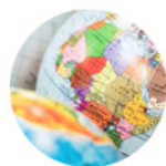
Global summary; regional coverage

IHS Markit's Chemical Economics Handbook – Isophthalic Acid and meta-Xylene is the comprehensive and trusted guide for anyone seeking information on this industry. This latest report details global and regional information, including