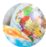
Global summary; regional coverage

IHS Markit's Chemical Economics Handbook – Furfuryl Alcohol and Furan Resins is the comprehensive and trusted guide for anyone seeking information on this industry. This latest report details global and regional information, including