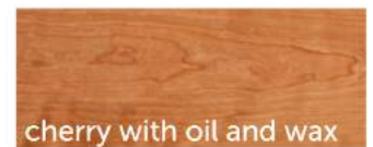
cherry with oil and wax