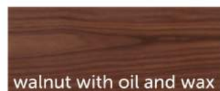
walnut with oil and wax