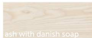
ash with danish soap