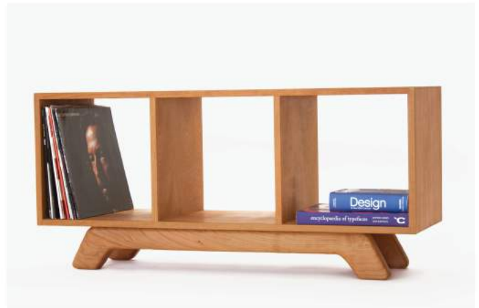
Shown in white oak