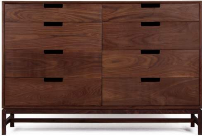
shown: solid walnut with natural oil + wax finish

A contemporary wideboy dresser inspired by Mid-century Modern design. Crafted from solid, American hardwood with a hand-rubbed, natural oil and wax finish. Available in custom dimensions and drawer configurations, as well as in different wood types. Made in Chicago.