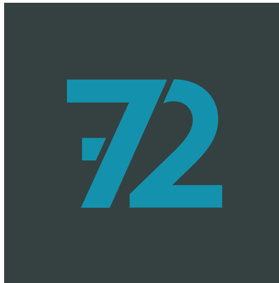
Dark Background Usage