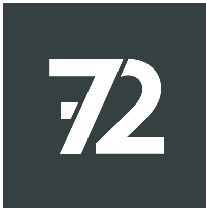
Alternate Dark Background Usage