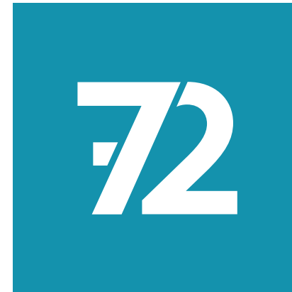
Primary Background Usage