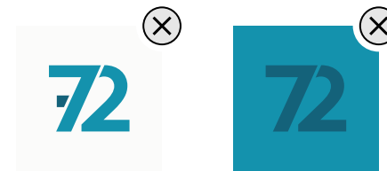
Don't invert colors or forget the tie of the backwards "F"