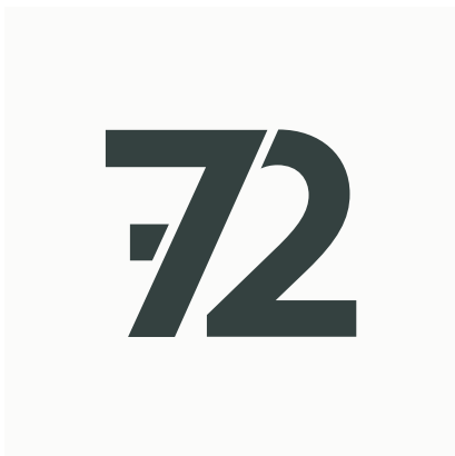
Alternate Light Background Usage