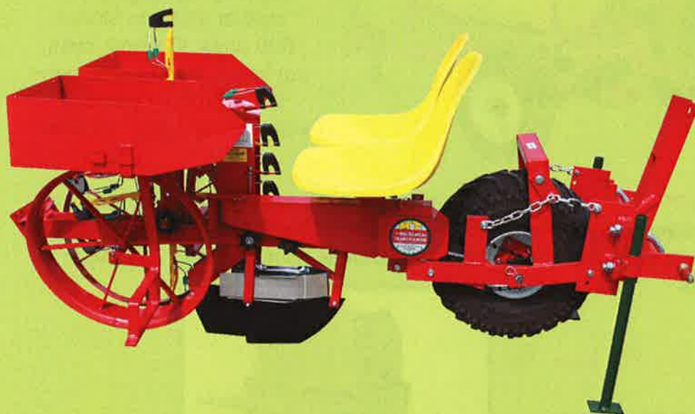
Model 1000 with standard fiberglass seats, round point shoe and optional single row 3-Point Hitch