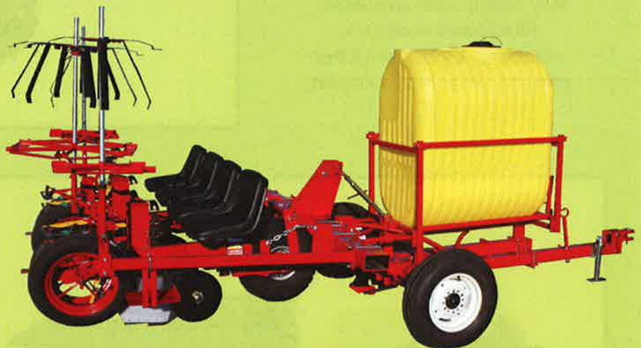
Model 803 2 1000 with carrousel tray holders

Includes trailer with 300 gallon poly tank, telescoping tongue, 4x7 toolbar, heavy duty 3-point hitch, and two 1000 units. Options shown: Cushion seats, poly double disc shoes, rubber packers, 7:60 x 15 tires on trailer, two 4 tray carrousel and one 6 tray carrousel.