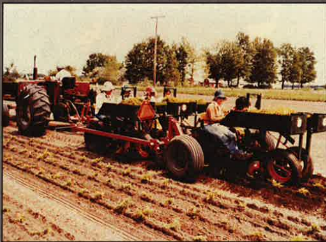
Model 1980-3 Three row 1980 with special framework for row spacings as close as 21"

2000 - Large nursery unit, similar to 1980, but 1/3 larger. Has offset pockets for taller plants and gauge wheel drive for accurate plant spacings. Includes: 6" x 12" shoe, 16" covering discs and large plant boxes with foot operated conveyors to bring plants forward.