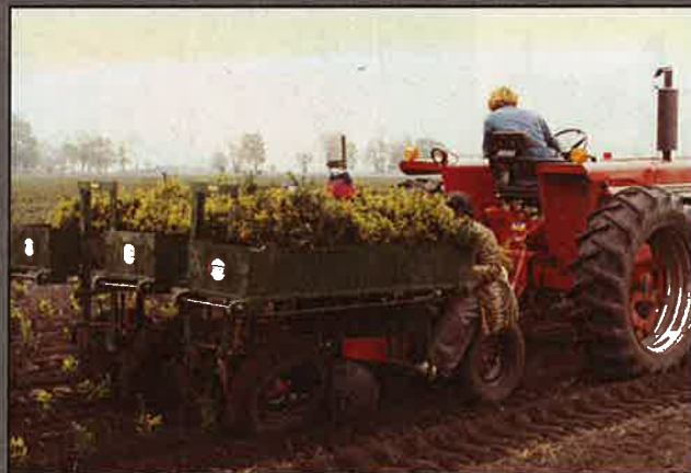
Model 2000-2 Two row 2000 planting large seedlings. Note straight evenly spaced plants and large capacity plant boxes