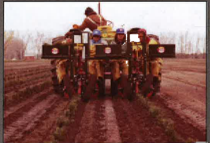
Model 1980-2 Two row 1980 nursery unit planting seedling 7" apart in row