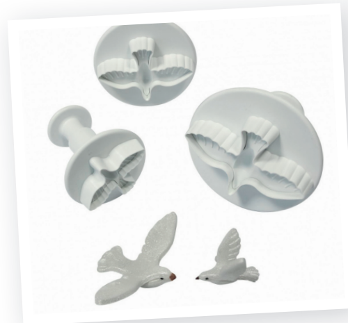
Dove Novelty Plunger Cutter, £7.45