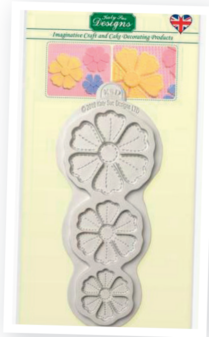
Katy Sue Pretty Petals Silicone Mould, £12.98