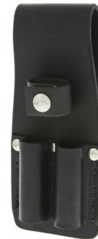
Nipps Frog With Safety Strap SKU: TMNF/S

Holds one pair of wire cutters with safety strap.