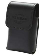
Smart Phone/ Android Pouch SKU: MPAP

Will fit most popular smartphones that have a cover or protective case.