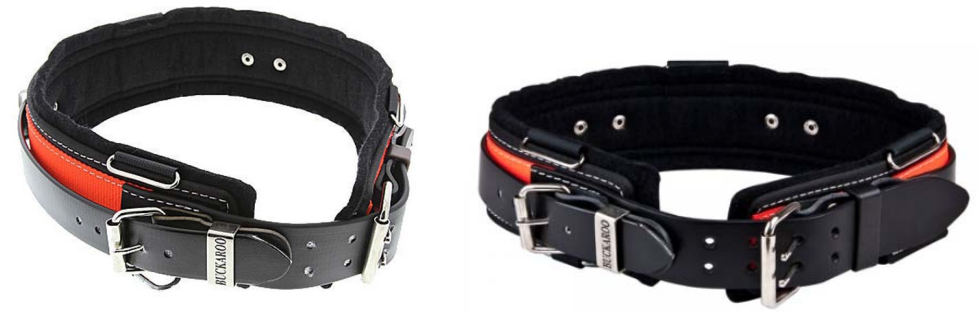
ALL ROUNDER TOOL BELT SKU: TMAR

The ultimate belt to suit the Steelfixer! (Tie Wire Reel not included) Weighing approximately 800grams and specially designed to provide comfort over extended periods. This belt features 2 upper belts straps - one dedicated to holding a tie wire reel and the other for tool frogs and pouches. The heavy suede flap is positioned to sit under the reel and protect the wearers clothing from the sharp wire ends and oil.