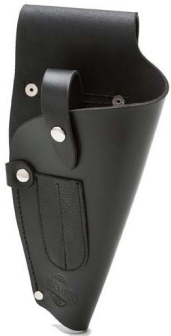
Cordless Drill Pouch SKU: TMDP

Provides a secure option for housing a two way radio. Features an elasticised safety strap.