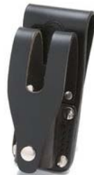
40mm Podger/Ratchet/Key Frog with Safety Strap SKU: TMRF40

Podger/Ratchet frog made from 4mm leather and moulded for longer lasting durability, featuring a supportive safety strap.