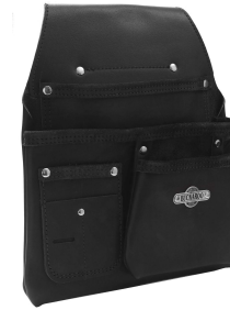
3 Pocket Formwork Bag - Black W260mm x H350mm SKU: NBF3B