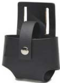
Tape Frog - Slotted SKU: TFS

Securely holds a larger tape ie Fatmax. Featuring a safety strap with a strong press stud fastening.