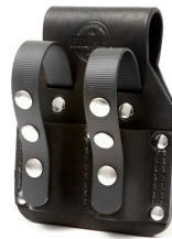
Double Ratchet Frog with Safety Strap SKU: TMDR/S

Podger/Ratchet frog made from 4mm leather and moulded for longer lasting durability and featuring a supportive safety strap.