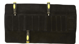
Chisel Roll SKU: TMCR

Holds 10 chisels either alternately or all in the one direction.