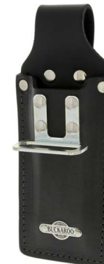
Chisel and nipps frog SKU: TCHNFS

Holds one pair of wire cutters with safety strap.