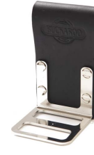
Double Nipps Frog SKU: TMDN