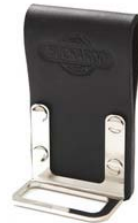
Nipps Frog SKU: TMNFS