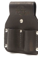
Double Ratchet Frog SKU: TMDR

Holds 2 ratchet/ podgers/ keys or drifts securely. Features adjustable safety strap.