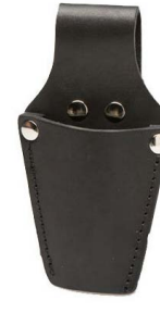
Pipe Wrench Frog SKU: TMPW/10

Suited to a range of tools including screwdrivers, nips, pliers, shifters and small hand tools. The D-ring at the base can hold gloves.