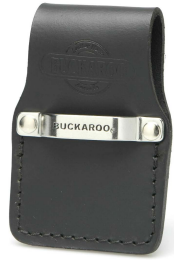
Tape Clip SKU: CTC

A compact solution for holding any size tape.