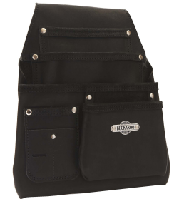
4 Pocket Formwork Bag - Black W260mm x H350mm SKU: NBF4B