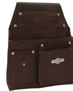
4 Pocket Formwork Bag - Brown W260mm x H350mm SKU: NBF4