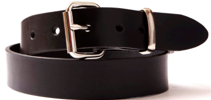
38MM LEATHER BELT SKU: KSB38

The KSB is a practical solution for wearing under your tool belt. It is 32mm wide and made from 4mm leather. It features a riveted on nickel plated roller buckle.