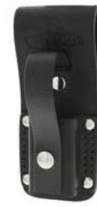
Shifter frog with Safety Strap SKU: TMSHS

Designed to fit both 12 inch and 15 inch shifters.