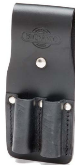
Nipps Frog - Moulded SKU: TMNF

Holds one pair of wire cutters. This frog has a lower drop.