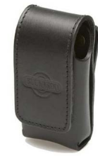
Phone Pouch Small SKU: MPP

To suit larger Android phones and the new iPhone 6 Plus Will fit new smartphones with or without a cover or protective case.