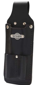
Chisel and Nipps Pouch SKU: TCHN

Holds one chisel and one pair of wire cutters.