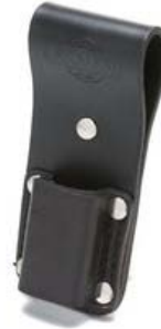
Shifter Frog SKU: TMSH

Designed to fit both 12 inch and 15 inch shifters.