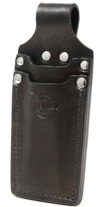
Twin Chisel Pouch SKU: TMTC

Designed to hold up to four chisels (2 in the front and 2 at the back)