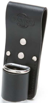
Scaffold Hammer Frog SKU: TMPH