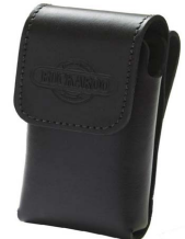
Smart Phone Pouch - Large SKU: MPPX

To suit iPhone 6 Will fit new smartphones including those that have a cover or protective case.