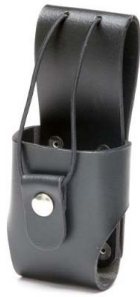
2 Way Radio SKU: TMRP

Features a metal piece to attach a power tool onto.