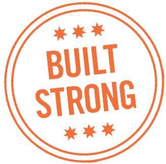
THE SIGNATURE TRADESMAN'S BACK SUPPORT TOOL BELT SKU: TMSRC

The Signature Tradesman's Back Support Tool Belt is the ultimate tool belt. Designed to offer support over extended periods, the more you wear this belt the more comfortable it gets. The upper belt strap allows you to add on tool holders and pouches and it is fastened with a heavy duty buckle.