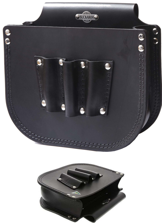
Large Rigger's Bolt Bag H200mm W250mm D100mm. SKU: TMBB

Made from a variety of 4-6mm thick leathers, the Buckaroo Riggers Bolt Bag is comfortable for the wearer to attach to a tool belt. We recommend this bag be worn with a back support belt only, and preferably with the braces attachment to offer optimal back support.