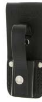
Shaped Level Frog with Safety Strap SKU: TMSLS

Holds a shaped level frog. Features a safety strap with heavy duty press stud.