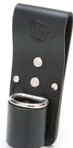
Scaffold Hammer Frog SKU: TMPH

Holds a claw hammer or any larger head hammer and features a safety strap.