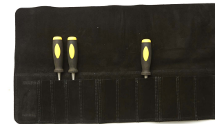
Chisel Roll 2 SKU: TMCR2

Holds one chisel and one pair of wire cutters.