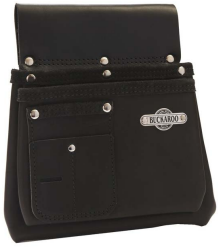
2 Pocket Nailbag - Black W220mm x H300mm SKU: NBS2B