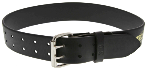
LEATHER 50MM TOOL BELT SKU: WB50

The All Rounder tool belt is a comfortable option that doesn't have built in back support. It is better suited for carrying lighter weight and fewer tools. It weights approx 600gms. The upperbelt is fully adjustable to support tool pouches or frogs and fastens with a heavy duty buckle.