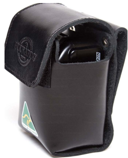
Power Tool Battery Pouch SKU: TMBPS

Suits most cordless drills regardless of battery size. It features drill bit holders and a safety strap.