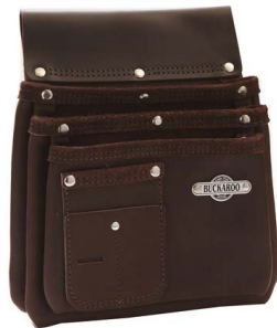
3 Pocket Nailbag - Brown W220mm x H300mm SKU: NBS3