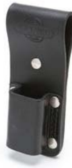
Shaped Level Frog SKU: TMSL