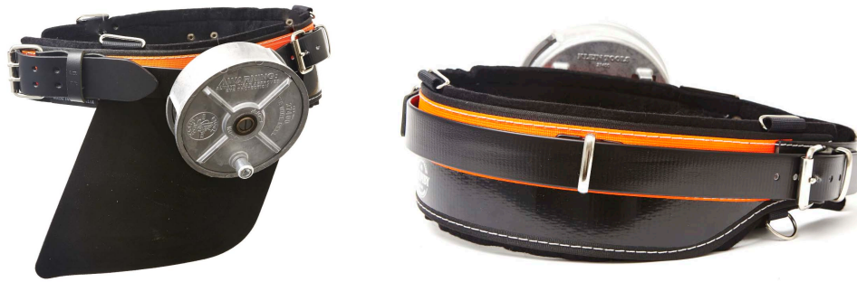
STEEFIXER BACK SUPPORT TOOL BELT SKU: TMSF

The ultimate belt to suit the Steelfixer! (Tie Wire Reel not included) Weighing approximately 800grams and specially designed to provide comfort over extended periods. This belt features 2 upper belts straps - one dedicated to holding a tie wire reel and the other for tool frogs and pouches. The heavy suede flap is positioned to sit under the reel and protect the wearers clothing from the sharp wire ends and oil.