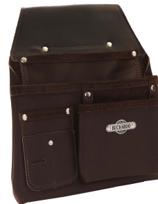
3 Pocket Formwork Bag - Brown W260mm x H350mm SKU: NBF3