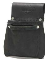
Hold All Bag W200mm X H220mm SKU: TMHA