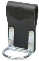
HAMMER FROG SKU: PHF

Holds a claw hammer or any larger head hammer.