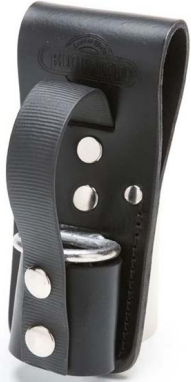
Scaffold Hammer Frog with Safety Strap SKU: TMPHS

The buckaroo TMPH and TMPHS frogs will suit the Scaffold hammer.