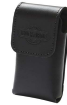
Smart Phone Pouch - Extra large SKU: MPPXL

Features VELCRO® fastening and holes at base for easier hearing