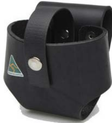
Tape Frog SKU: TFL

A compact solution for holding any size tape.