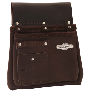
2 Pocket Nail Bag - Brown W220mm x H300mm SKU: NBS2