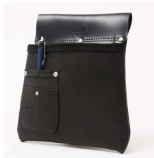
Tablet Pouch W250mm X 280mm SKU: TMTP