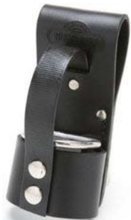
Ultimate Hammer Holder SKU: TMHF

Holds a scaffold hammer or any narrow handled hammer and features a safety strap.