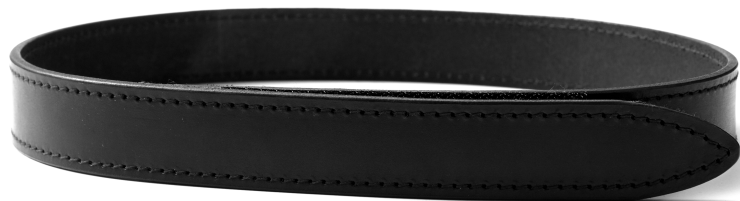
VELCRO FASTENED UNDERBELT SKU: VEL32

The KSB is a practical solution for wearing under your tool belt. It is 38mm wide and made from 4mm leather. It features a riveted on nickel plated roller buckle.