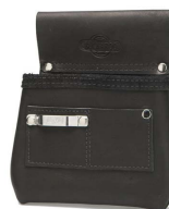
Cabinetmaker's Bag W200mm X H230mm SKU: TMCMB