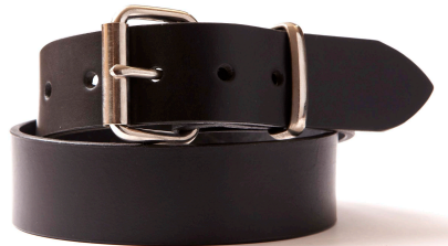
32MM LEATHER BELT SKU: KSB32

For over 40 years we have been crafting belts from hand selected leathers and quality hardware. Available from size 28" upwards and in black leather only.