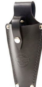
Aviation Snips Pouch with Safety Strap SKU: TMASS

Holds a knife, pen/pencil and small tools. Made from waterproofed boot upper leather.