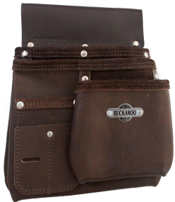
3 Pocket Nailbag - Brown W220mm x H300mm SKU: NBS1