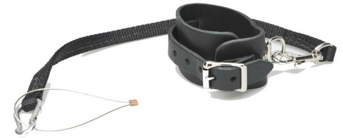
Wrist Lanyard SKU: TML

This frog is designed to securely hold a 10" pipe wrench.