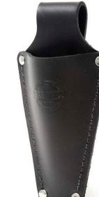
Aviation Snips Pouch SKU: TMAS

Suits 1 pair of aviation snips and features a safety strap.