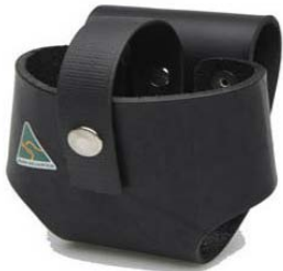
Tape Frog - Extra Large SKU: TFXL

Securely holds an 8-10m tape and featuring a safety strap with a strong press stud fastening,