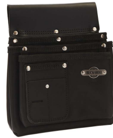
3 Pocket Nailbag - Black W220mm x H300mm SKU: NBS3B