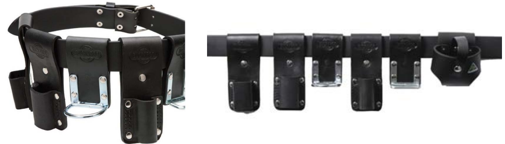
ALL-IN-ONE SCAFFOLDER'S BELT KIT One size fits all SKU: TMSBK

A 50mm (2 inch) wide all purpose traditional tool belt available in a variety of sizes. Featuring a heavy heeled double prong buckle, this belt is made from 5mm thick genuine leather, the thickest we can find. No steroids or added chemicals have been added to boost up the thickness.