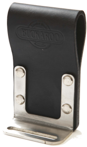
Power Tool Holder SKU: NGH

Features a metal piece to attach a power tool onto.