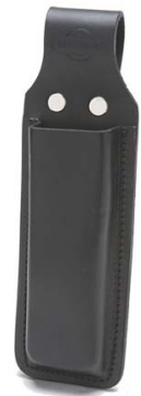
Straight Level Frog SKU: TMLRP

Holds a shaped level frog. Features a safety strap with heavy duty press stud.