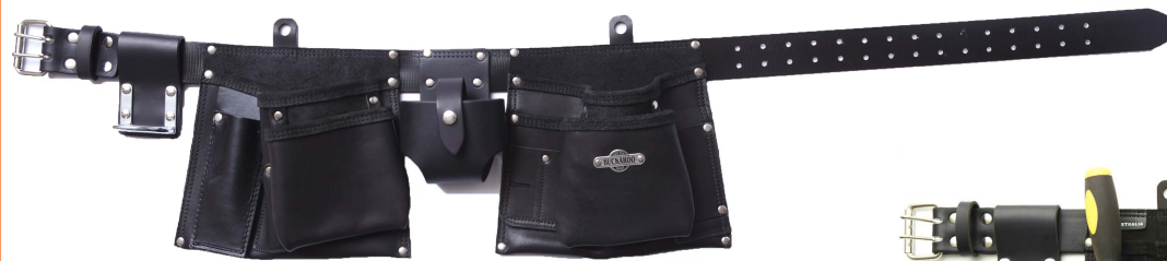
BLACK SKU: TMABB

This belt is One Size Fits All. The maximum size is 48 inch. Larger sizes can be made upon request.