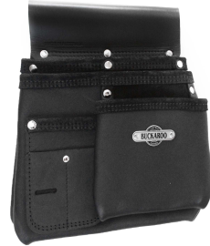
3 Pocket Nailbag - Black W220mm x H300mm SKU: NBS1B