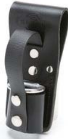
Scaffold Hammer Frog with Safety Strap SKU: TMPHS

Holds a scaffold hammer or any narrow handled hammer and features a safety strap.