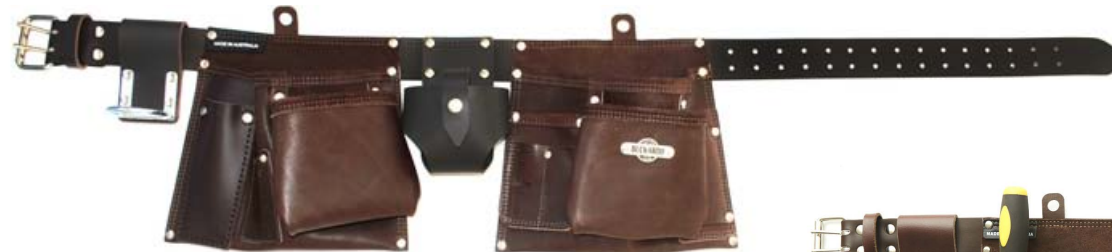
BROWN SKU: TMAB