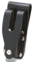
30mm Podger/Ratchet/Key Frog with Safety Strap SKU: TMRF30

Podger/Ratchet frog made from 4mm leather and moulded for longer lasting durability and featuring a supportive safety strap.