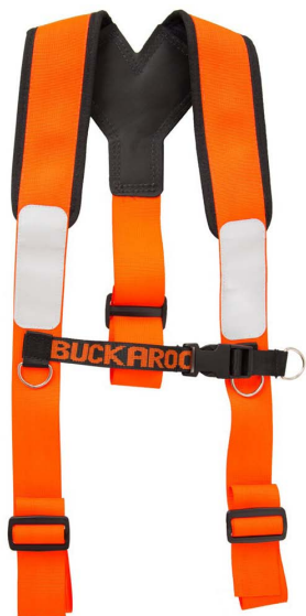
Shoulder Braces - Orange One size fits all SKU: TMH