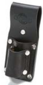
Double Shifter Frog SKU: TMDS

Designed to fit both 12 inch and 15 inch shifters.