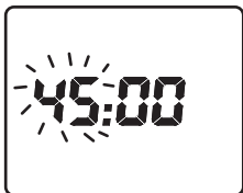
Fig. 5. Set Soccer Timer

In the SOCCER TIMER mode, the hour, minute and second are displayed on the lower row, the SOCCER TIMER on the middle row and the STOPPAGE TIMER on the upper row. The SOCCER TIMER is preset to 45 minutes (can be set to other values by pressing and holding B for 2 seconds when the timer is not counting down.). Pressing B can start the countdown function. The STOPPAGE TIMER is a count-up timer for keeping track of the stoppage time. Press A to start in stoppage times and press A again to stop when the play resumes. When the STOPPAGE TIMER is counting, the 4 digits are flashing together. At 30 and 15 minutes before the countdown reaches 00:00 00, the timer will give 1 single beep. After crossing 00, the SOCCER TIMER will start counting up. At 30 seconds before the time of the STOPPAGE TIMER, the timer will give 15X 4 short beeps to alert the user that the play time is almost up. When the SOCCER TIMER and the STOPPAGE TIMER matches, the timer will give 10X3 short beeps to tell the user that the playing time is finished. Pressing any button can stop the sound. The SOCCER TIMER keeps running until B is pressed. Press and hold B for 2 seconds will reset the SOCCER TIMER to the previously set countdown time. Press and hold A for 2 seconds will reset the STOPPAGE TIMER. When the SOCCER TIMER is reset, press and hold B for 2 seconds, we can then go into the SET SOCCER TIMER mode and the MINUTE digits will flash, as shown in Fig. 5.