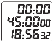
Fig.4. Soccer Timer Mode

From the ALARM time display, press C to go into the SOCCER TIMER display mode, as shown in Fig. 4.