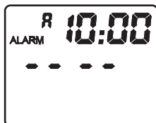
Fig.3. Alarm Time Display

From NORMAL DISPLAY, press C to display the ALARM time, as shown in Fig.3.