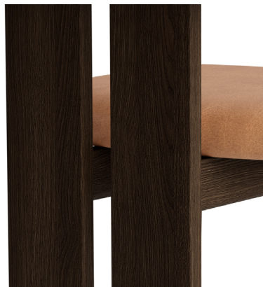
DARK SMOKED OAK DUNES CAMEL 21004