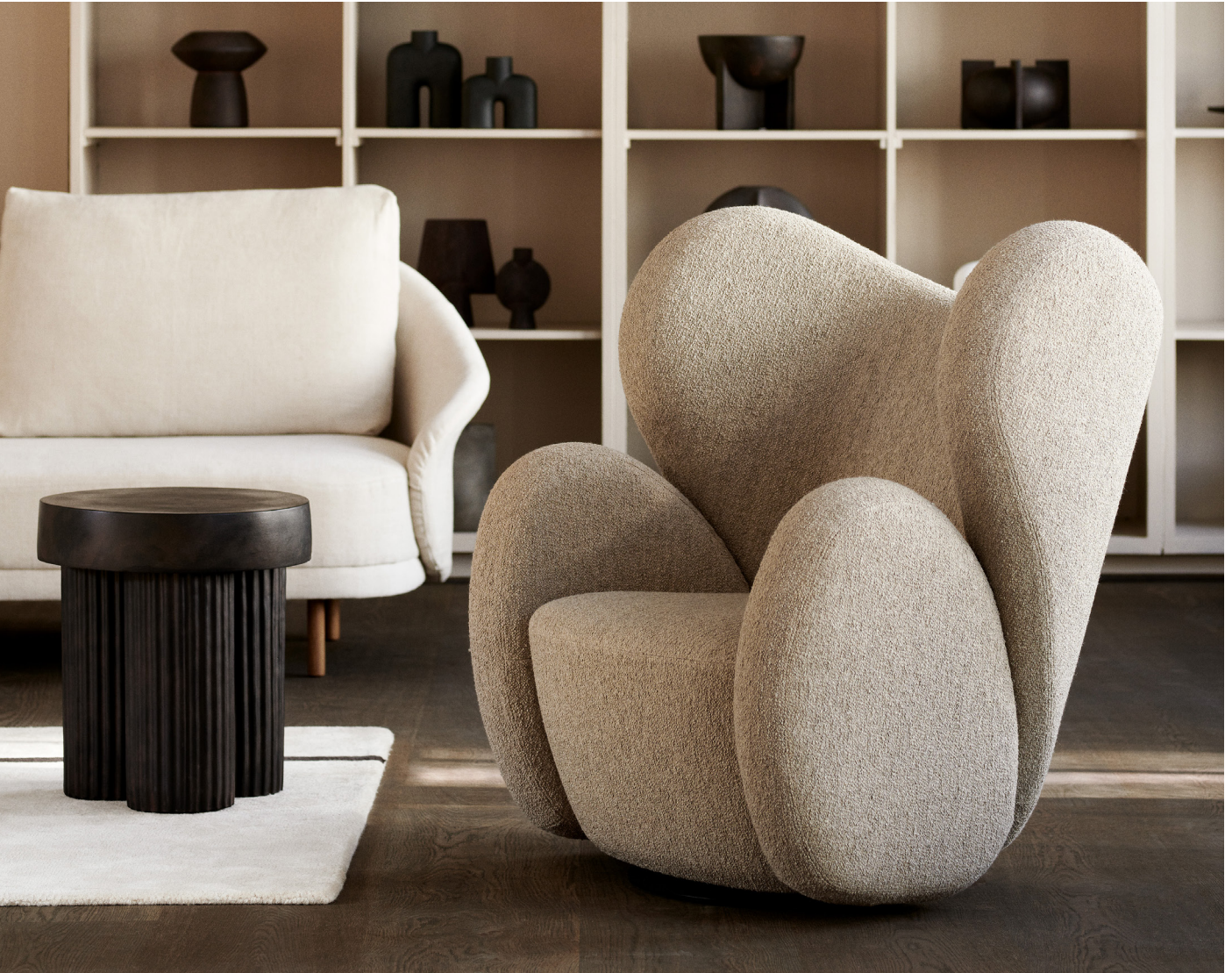
Big Big Chair in Barnum Gear Side Table New Wave in Linen