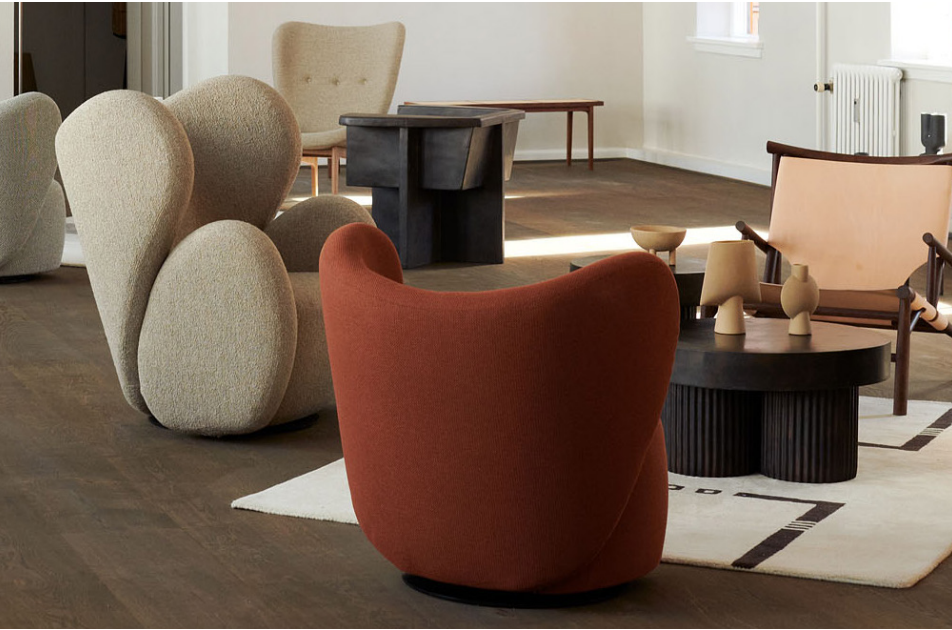
Big Big Chair in Barnum Little Big Chair in Merit Gear Coffe Table Samurai Dark Stained